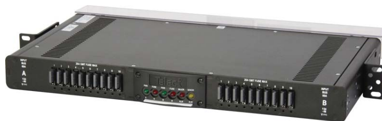
GMT10-BLK Front View