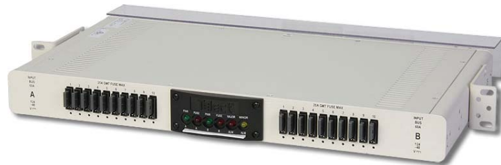
GMT10 Front View