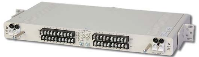
GMT10 Rear View